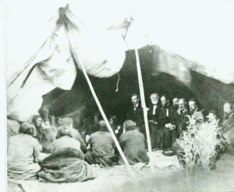
Gen. William Sherman in council on the Plains from Scenes in the Indian Country .

• General, Wayman, and Time Table Brochure Collections, which include maps, travel and promotional brochures, and ephemeral publications from the late nineteenth century to the present on the American West.