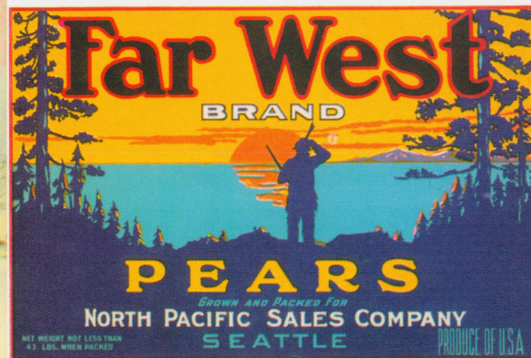
Far West Fruit Packers Labels - 20th Century