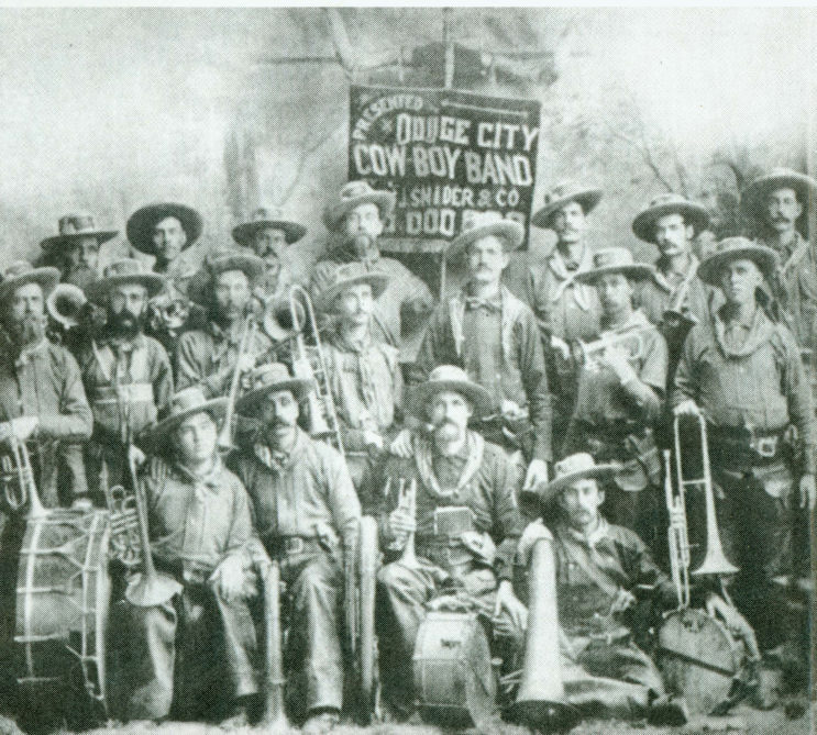
Cowboy Band at First National Cattlemen's Convention - St. Louis 1884

In no small way, St. Louis was forged on the anvil of Manifest Destiny; its earliest library – the Mercantile – took advantage of this circumstance so much so that by the 1870's its Head Librarian could proudly remark that "the history of our country's early and aboriginal history claims our special attention." The leaders of the Mercantile Library clearly understood the historical moment which they seized. They documented this epoch on their new library's shelves. Because of that, almost from its inception, St. Louis possessed a national library which collected the heritage of the new nation. Its greatest achievement has been that from that early impulse the Library has continued to create one of the most respected and comprehensively developed public collections of Western Americana.